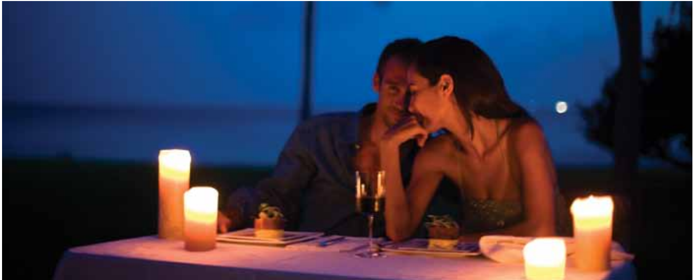
Escape into NIZUC's world of refined relaxation.