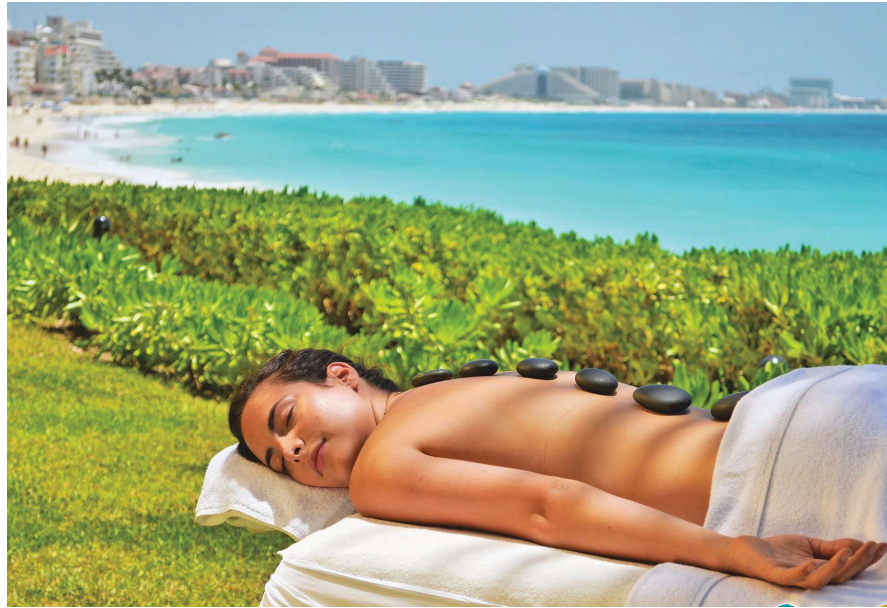
Cancun has greatly diversified its image as a vacation destination, as it now offers many options for families (top left), golfers (bottom left) and spa enthusiasts (above).

As Cancun continues to grow in its fourth decade as a premier destination, it continues to evolve. If you’ve been to Cancun in the past, it’s time to come back for another look. And if you’ve never been, what are you waiting for? And make sure you bring your golf clubs! ■